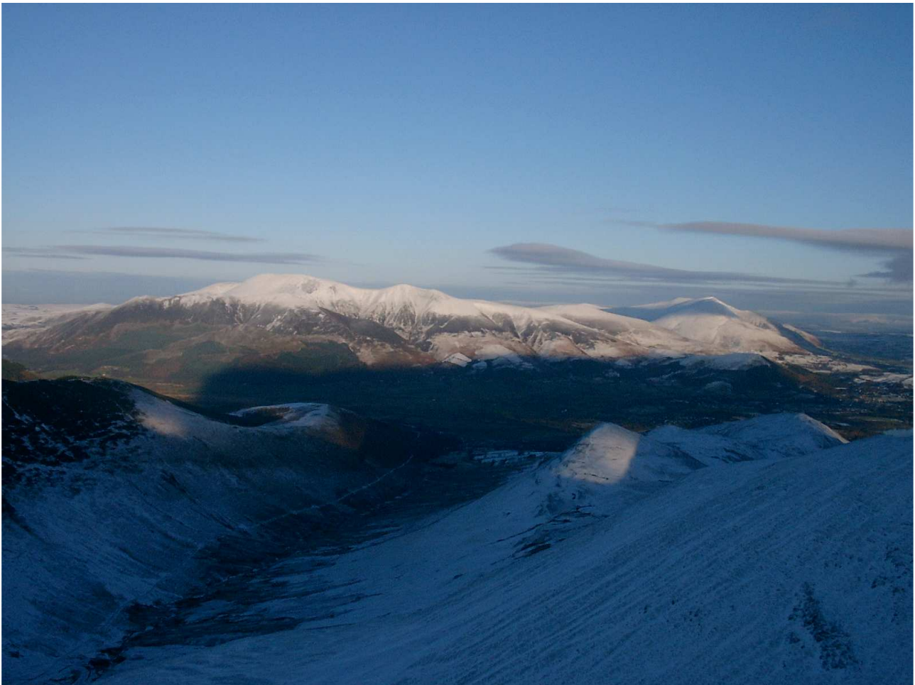
View of Skiddaw from south west of Keswick on Boxing Day