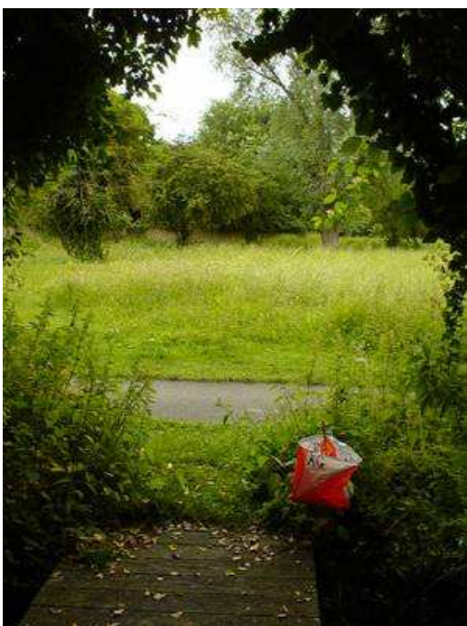
3. Footbridge NE end - looking NE