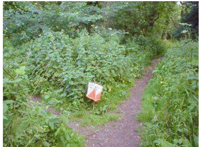
8. Path junction - looking E