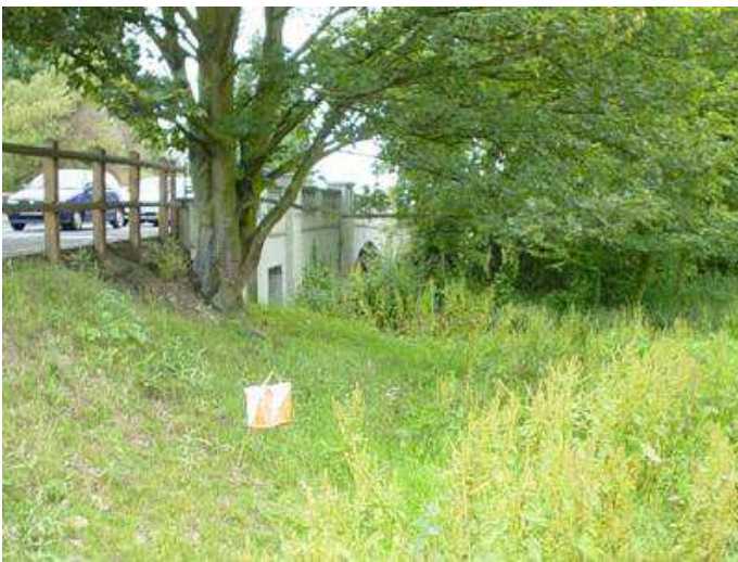
1. Earthbank foot - looking W

46 The Crossways, Merstham, Surrey RH1 3NA