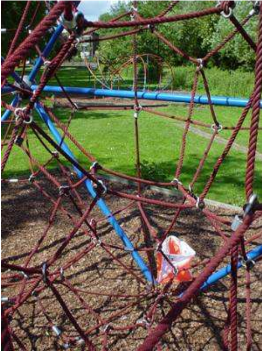
5. Climbing frame N side - looking N