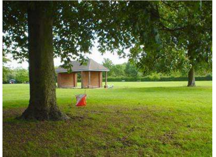
6. Middle distinct tree S side - looking SE