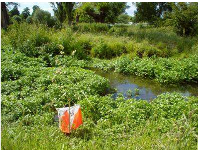
9. Stream E side - looking NW