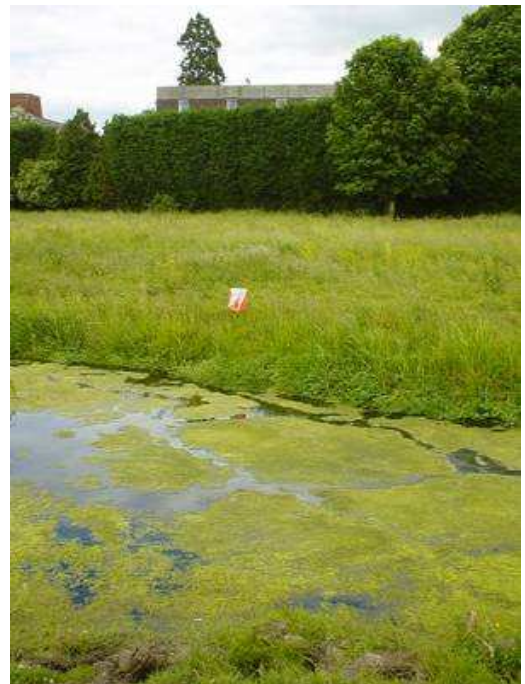
2. Stream E side - looking E