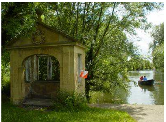
4. Ruin W side - looking S