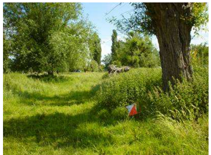
10. Northern distinct tree E side - looking S