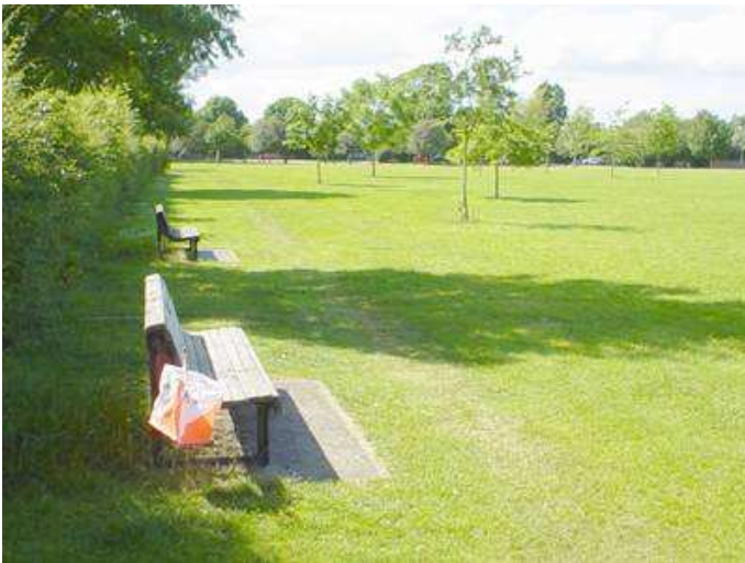
7. Eastern seat E side - looking W